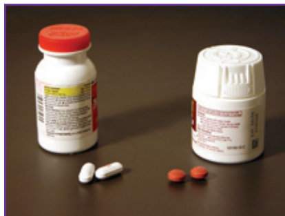
Some discomfort is normal

It's normal for your teeth to be a bit sensitive to heat, cold, and pressure. That's because we removed some tooth structure, then placed new materials on your teeth. The sensitivity should subside after several days. If it doesn't, be sure to call our office.