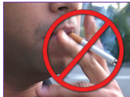
Avoid tobacco products

Your gums may also be sore and somewhat swollen for several days. Rinsing three times a day with warm salt water will relieve the pain and swelling. Dissolve one teaspoon of salt in one cup of warm water, gently swish, and then spit carefully.