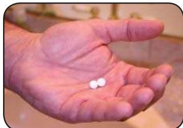
Take medications as instructed