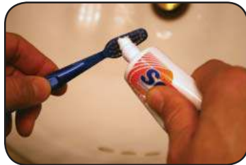
Use desensitizing toothpaste

Now that we've placed your permanent inlay or onlay, it is important to follow these recommendations to ensure its success.