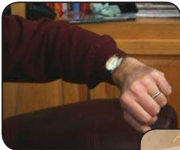
Do not chew for 30 minutes

It is not a problem for a small portion of a temporary filling to wear away or break off, but if the entire filling wears out, or if a temporary crown comes off, call us so that it can be replaced.